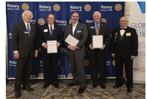
Top 3 Total Foundation Giving