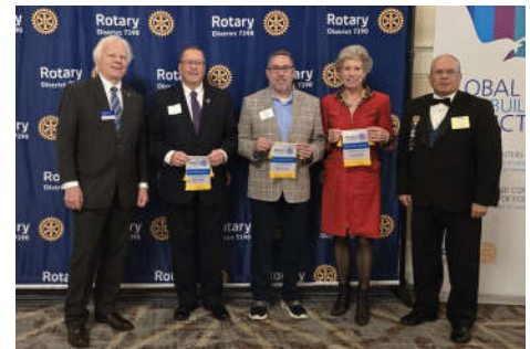
Top 3 in Annual Fund Per Capita Giving