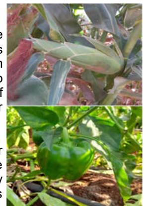
A Bumper Crop of Vegetables

The primary contact for this project is Kathleen Stoup.