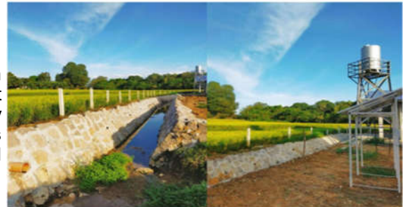
CIRCUMFERENTIAL CANAL and ELEVATED WATER TANK

The primary contact for this project is Jess Socrates.