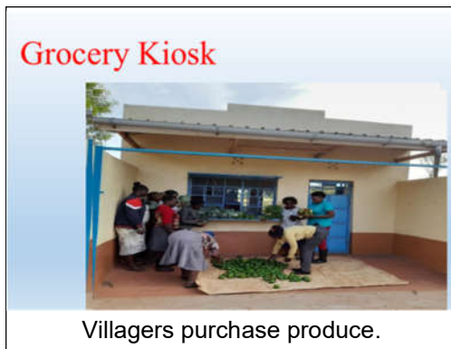
Villagers purchase produce.

Sponsored by Rotary Club of Carlisle and Rotary Club of Thika, Kenya