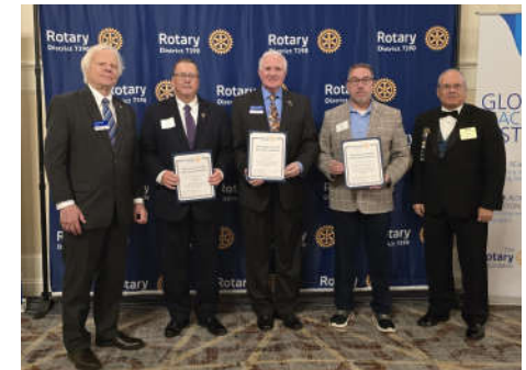
Top 3 Total Annual Fund Giving