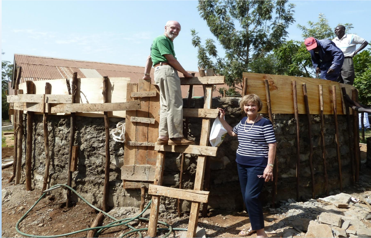
Rainwater storage tank under construction