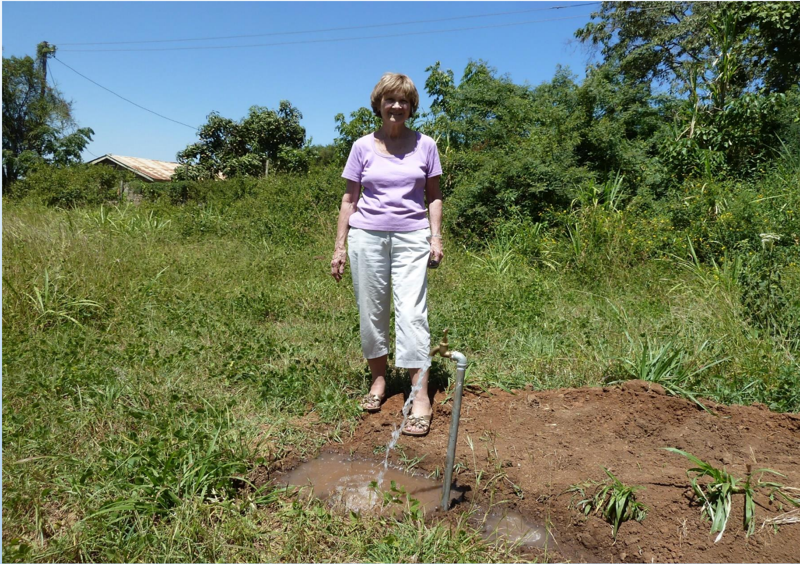
Faucet at farming area