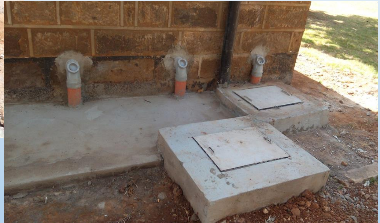
Septic area during/after construction